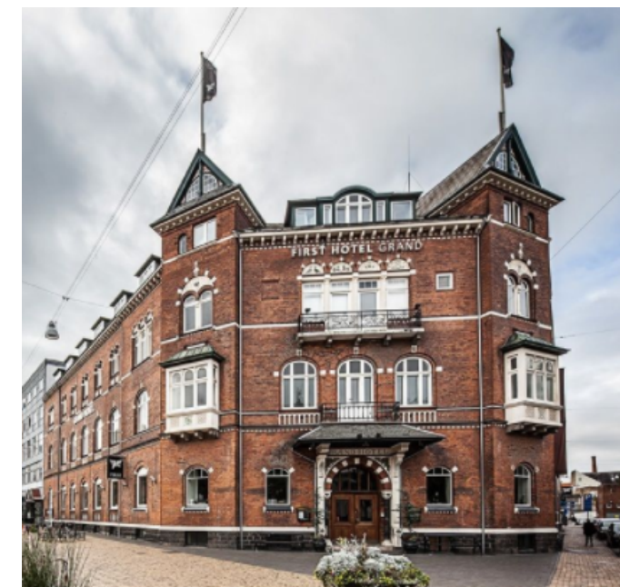
3- First Grand Hotel