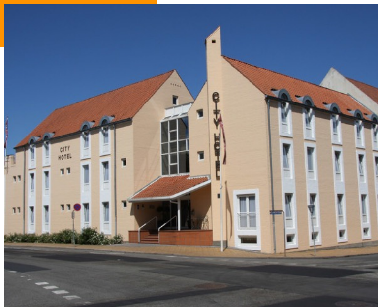
2 - City Hotel Odense

www.cabinn.com/en/hotel/cabinn-odense-hotel