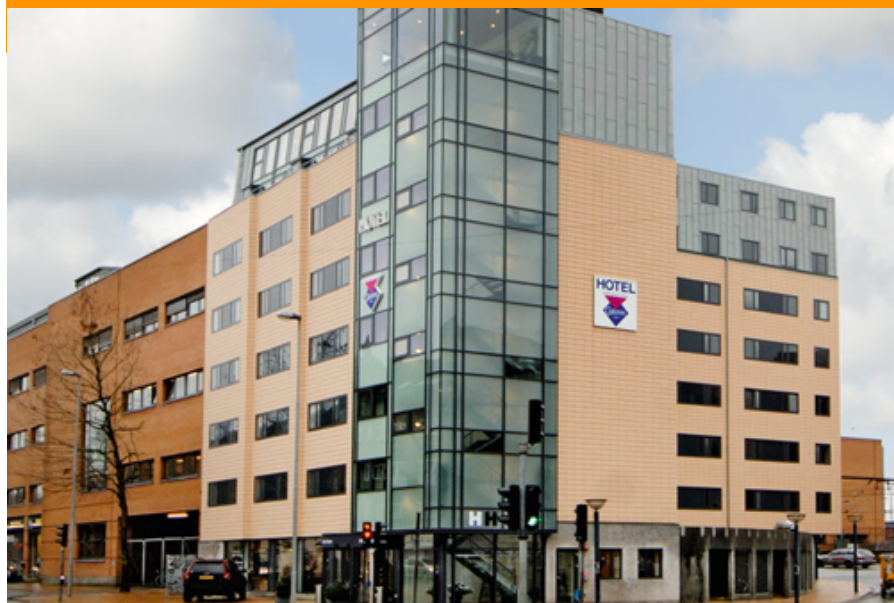
1- CABINN Odense Hotel